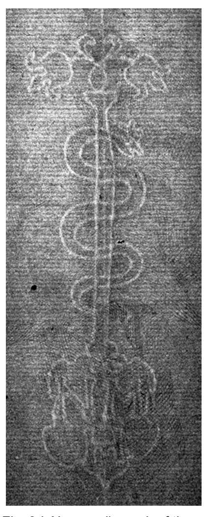
Fig. 3d: X-ray radiograph of the watermark

[*] A comprehensive description of the project and of the results obtained for artworks can be found in: