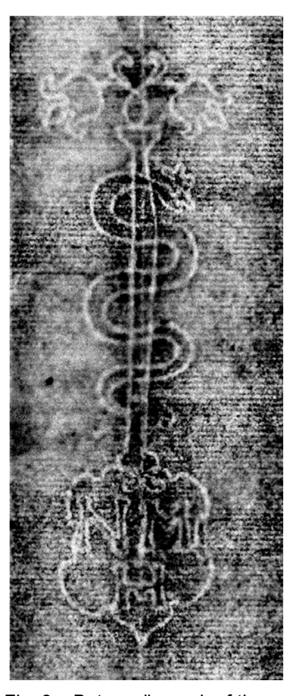
Fig. 3c: Beta-radiograph of the watermark, which is clearly visible but partly diffuse due to the poor contact of the film to the object.