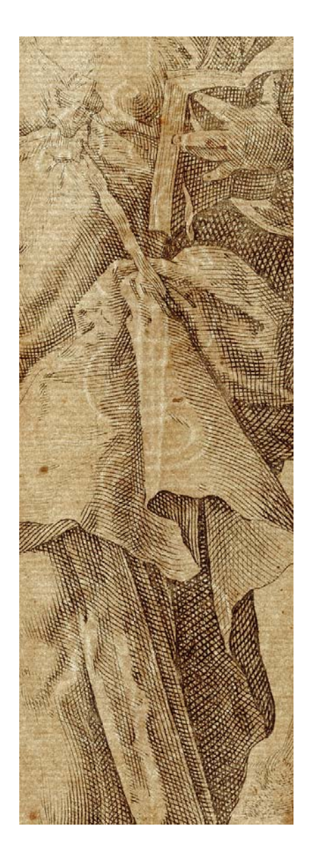
Fig. 3a: Image of the area with watermark in transmission mode